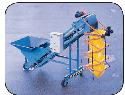
Fallbreaker FB ZZ on an elevator.

The fall breaker is designed for insertion in various types of hopper. It consists of a number of fixed sections that ensure that products fill the hopper gently, thus drastically reducing damage to them.