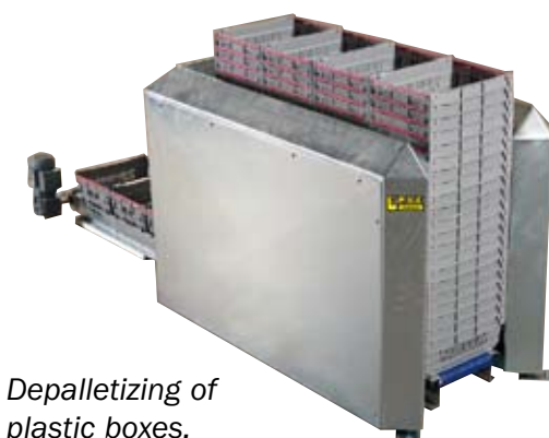
Depalletizing of plastic boxes.