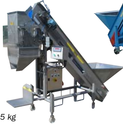
Processed vegetables etc. 5 - 25 kg