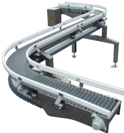
Rib conveyor for trays, bags and boxes.