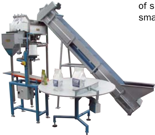
Packaging and sealing 0,5 - 5 kg

EMVE produce a wide range of simple solutions for small and high capacities.