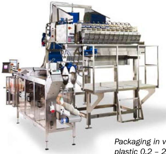
Packaging in v-film plastic 0,2 - 25 kg