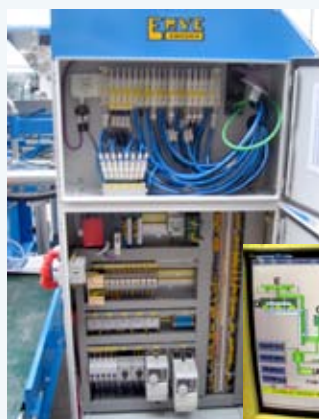
Electronics and automation