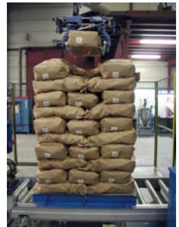
Robot palletizing of sacks, cardboard –or plastic boxes etc.