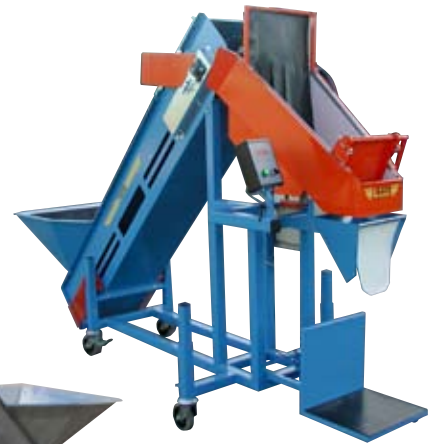
For sack and box 5 - 300 kg