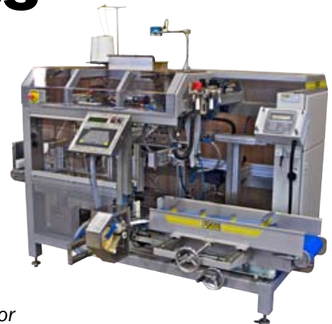
Verticalbagger for plasticbag 0,1 - 7 kg