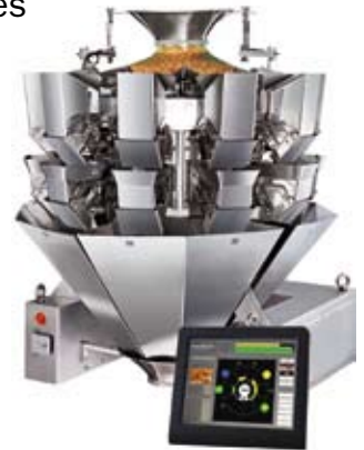
Multi-head weigher for compact solutions with high capacity.