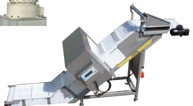
Checkweighers and metal detectors.