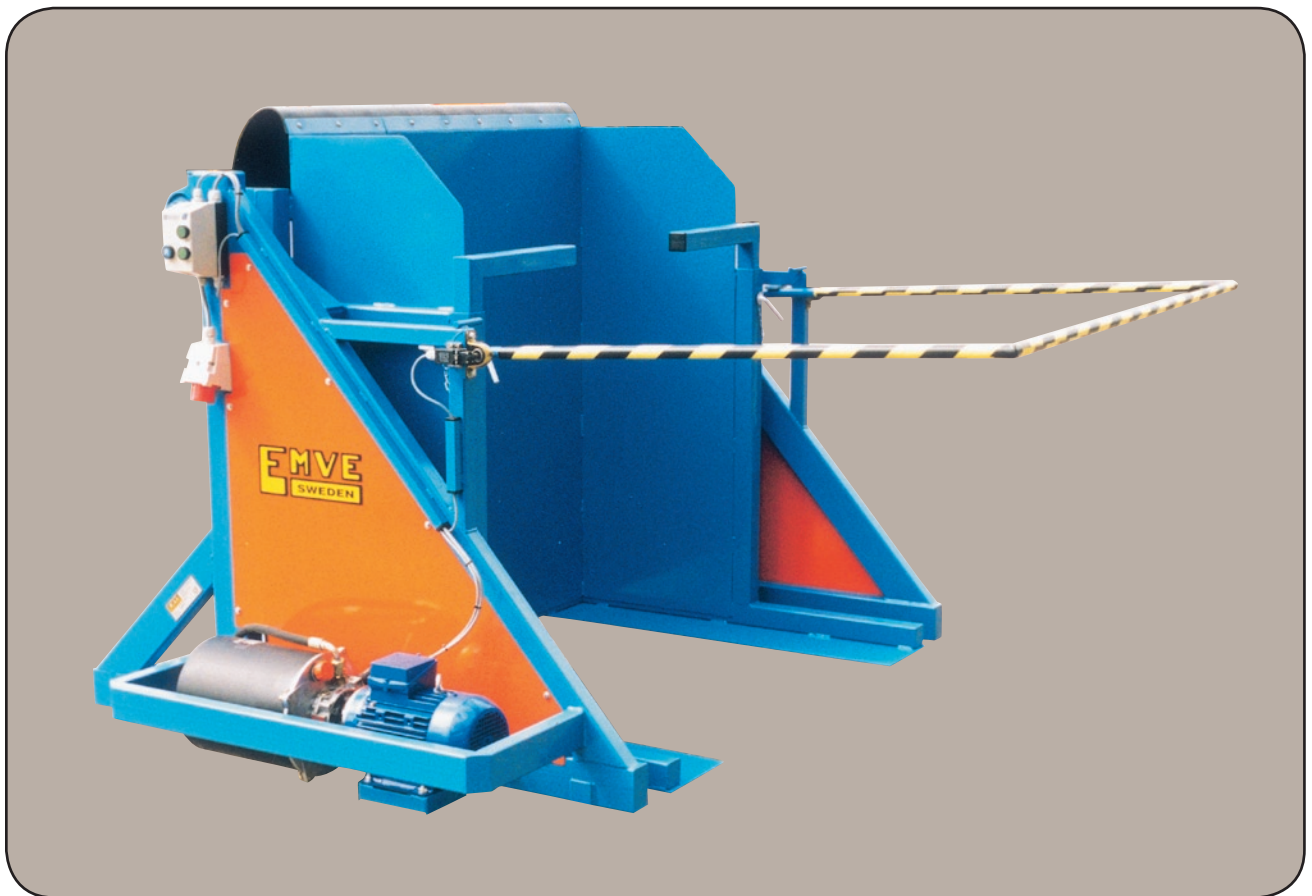
Box turner BT H600 for 600 kg boxes.

For emptying 600, 800 and 2.000 kg boxes.