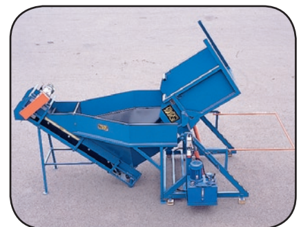
BT H600 with hopper H F1 ME

The Box Turner can be modified for emptying large sacks instead of boxes. The BT 2000 is available in versions to individual specifications depending on box dimensions.