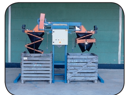
Box filler BF CZ with zig-zag fall-breakers.

Model BF CE is fitted with vertical drop elevators to ensure the most gentle filling possible, even with carrots.