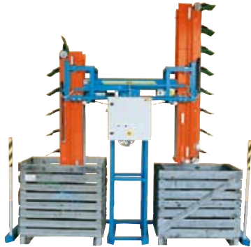
Box and jumbobag fillers