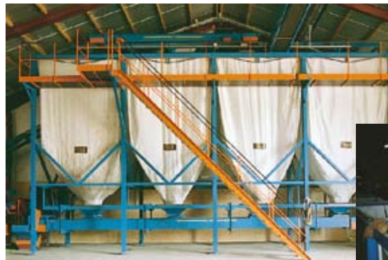
Storagebuffers, 1–25 m 3