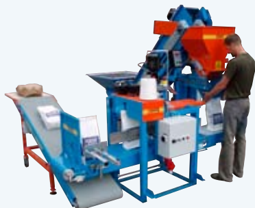
Semi automatic packaging