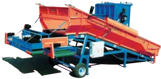
Intake from bulk or box

EMVE designs and manufactures intake for bulk, box and jumbobags. Filling into boxes or storagebuffers comes in many versions. Flow weighers and samplers can also be integrated.