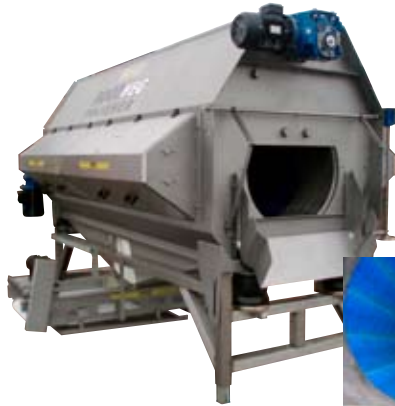
Polishing 1–25 t/h