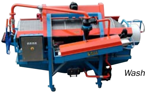
Washing 1–15 t/h